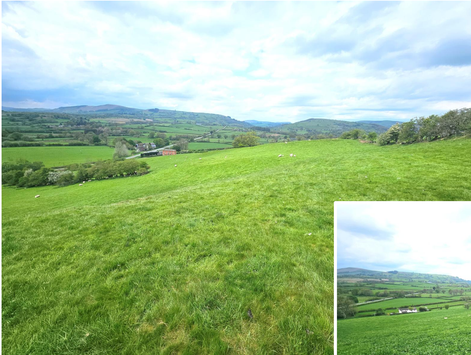
Lot 3 – 21.8 acres